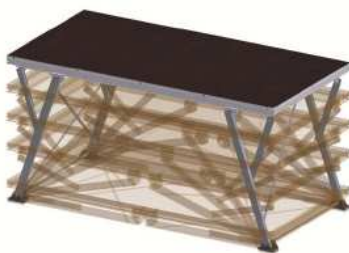
S1 adjustable height